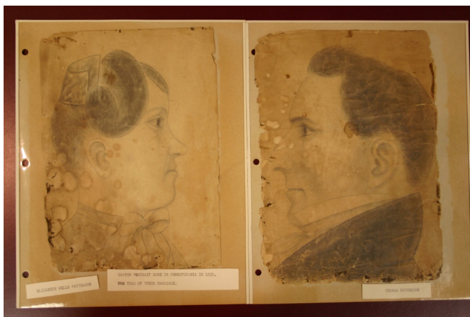
Crayon portrait done in PA the year of their marriage